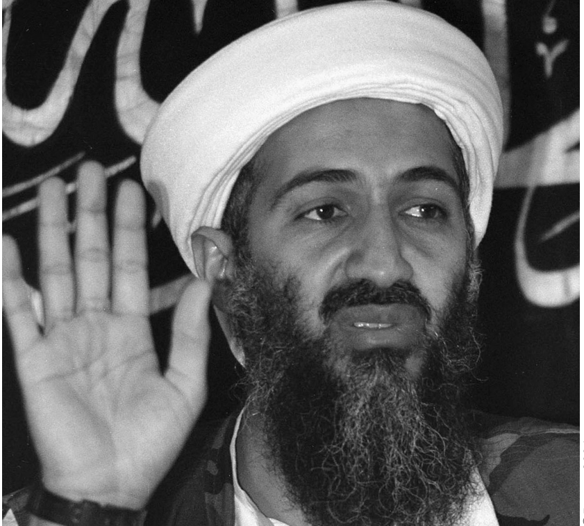
Usama Bin Ladin at a news conference in Afghanistan in 1998

inveighed against the presence of U.S. troops in Saudi Arabia, the home of Islam's holiest sites. He spoke of the suffering of the Iraqi people as a result of sanctions imposed after the Gulf War, and he protested U.S. support of Israel.